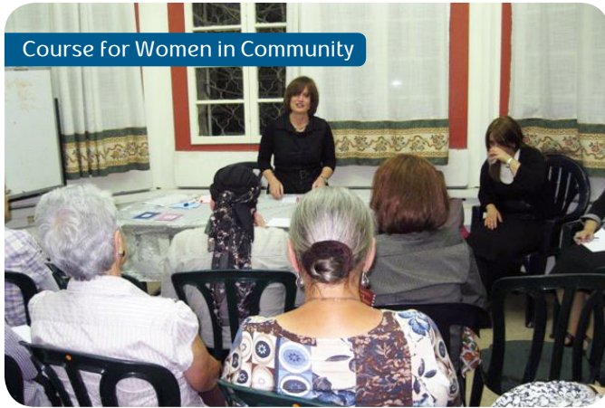
Course for Women in Community